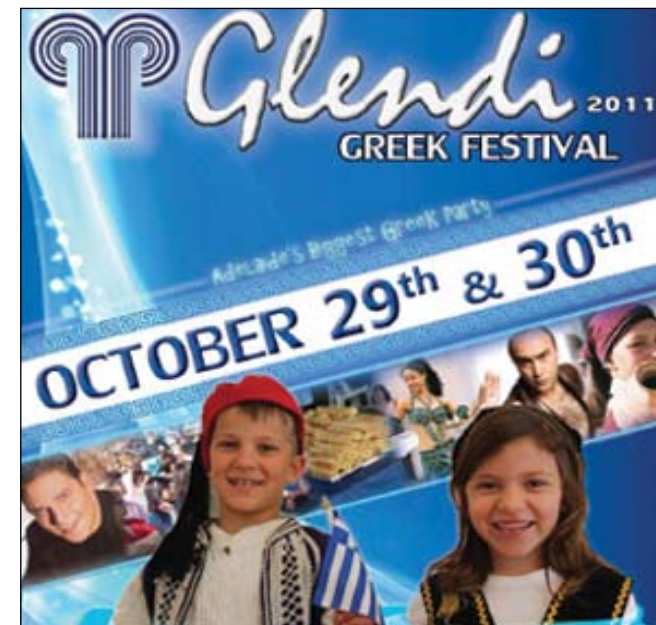
Sponsored by the Greek Tribune