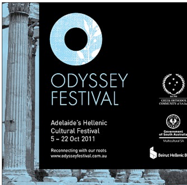
Sponsored by the Greek Tribune