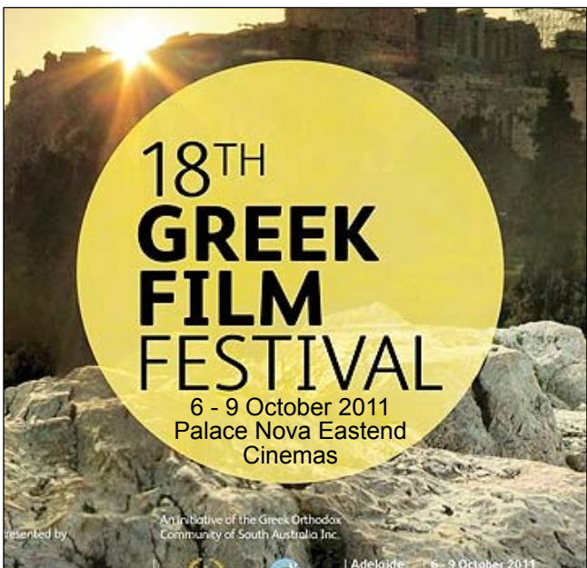
Sponsored by the Greek Tribune

* Odyssey is proudly sponsored by the Greek Tribune