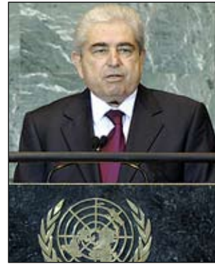
President Christofias addressing the UN General Assembly

President Christofias told the UN General Assembly that in recent years, the Republic of Cyprus has started the process